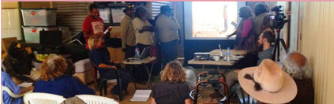
Blackstone and Warakurna teams giving a presentation of the burning conducted in the 2015 fire season.