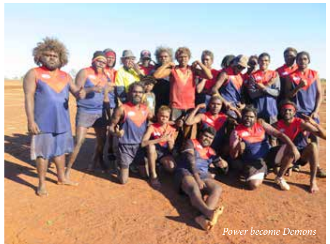
Power become Demons