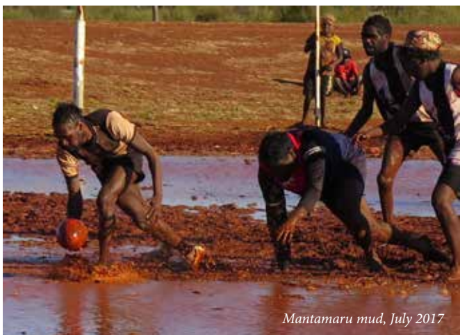
Mantamaru mud, July 2017