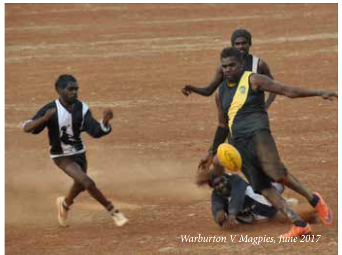
Warburton V Magpies, June 2017