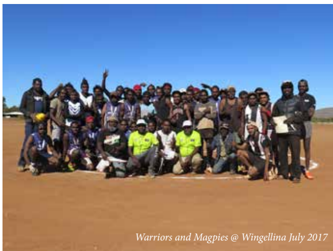
Warriors and Magpies @ Wingellina July 2017