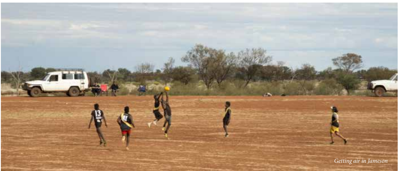
Getting air in Jameson