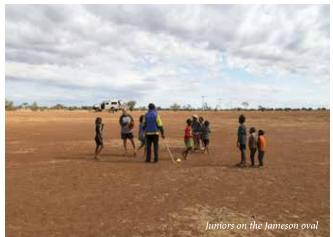
Juniors on the Jameson oval