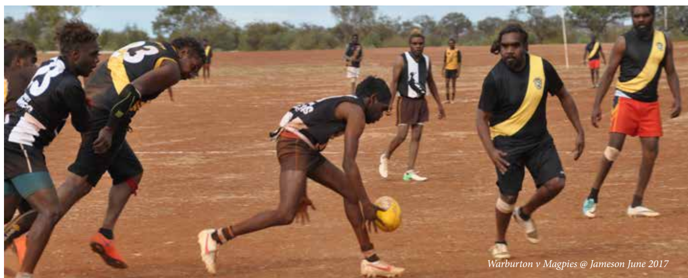
Warburton v Magpies @ Jameson June 2017