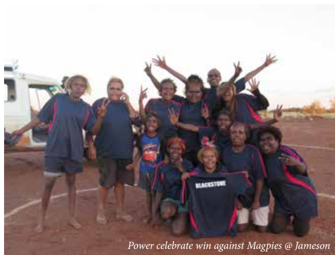
Power celebrate win against Magpies @ Jameson