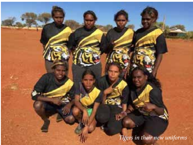
Tigers in their new uniforms

Everyone is looking forward to the final rounds, knowing the Grand Final will be played in the community leading the AFL Premiership Table following the semi-final clash between Team 1 and Team 2 on Saturday 02 September. The Softball Grand Final will also be played at that venue to enable more efficient transport of players. According to our fixtures, the Grand Finals will be played on Saturday 23 September.